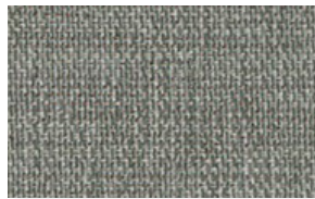
high line lf & bo*