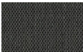
empire lf & bo*

N.B. - Colours may vary from the digital representation. * Denotes available in privacy and blockout qualities