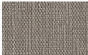
greenwich lf & bo*