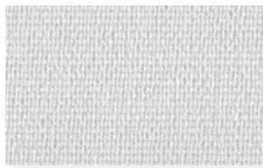
snow lf & bo*