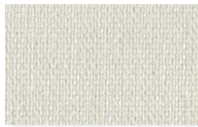
frost lf & bo*